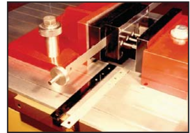
Punch tool for flat bars